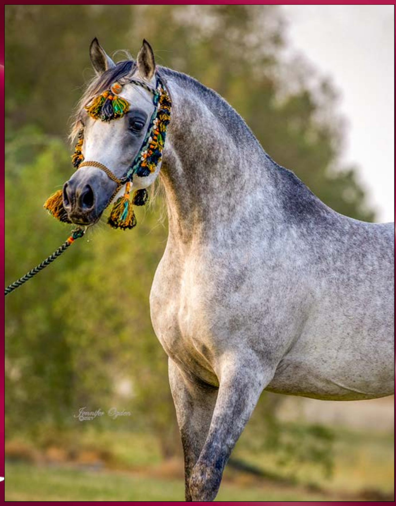
Qamar El Zaman Al Waab (Ansata Nile Echo x D'Aajaa Al Naif)